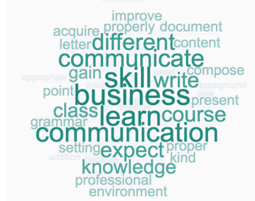
Figure 1. Application of Pre-Testing/ Student Feedback

We then plan to break the remaining session time into three blocks: